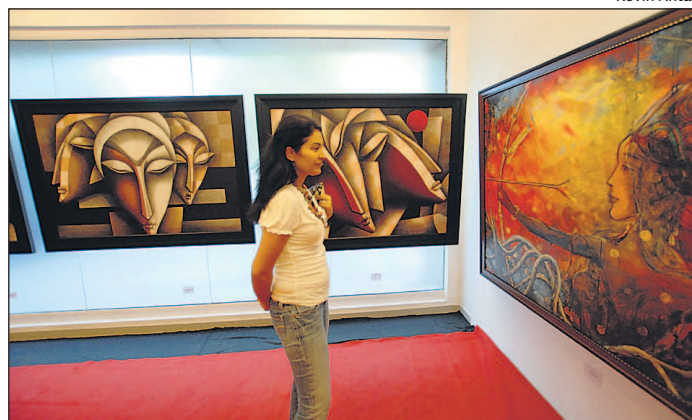
A visitor at the exhibition of artworks by six artists in the city