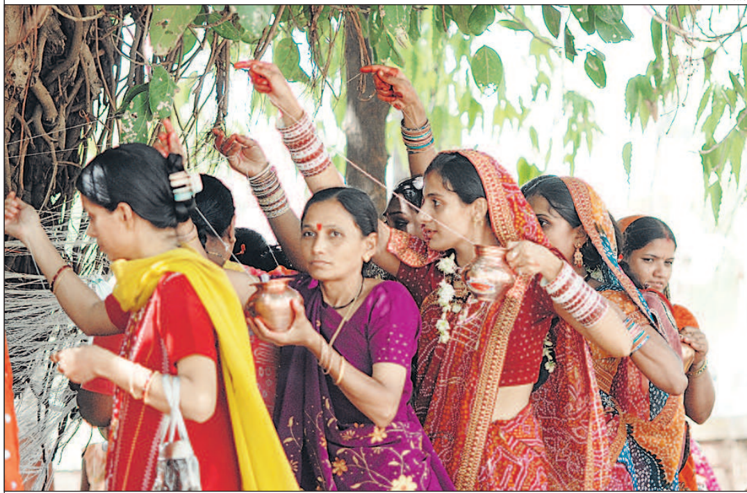
Women perform puja on the occasion of Vad Savitri in Gandhinagar