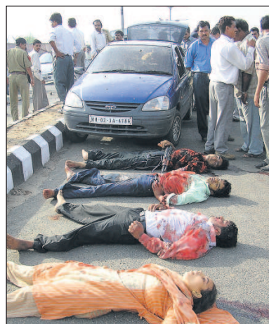
File photo of the encounter spot