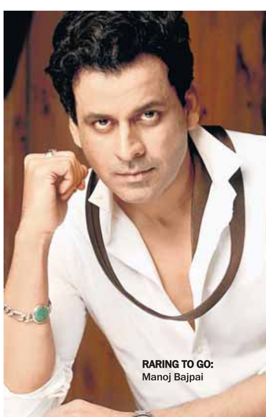
RARING TO GO: Manoj Bajpai

Actor Manoj Bajpai is basking in the success of his Telugu films